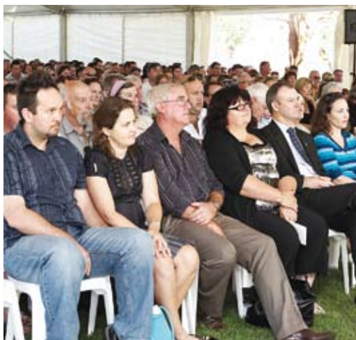
2009 Donor Honour Board Ceremony.